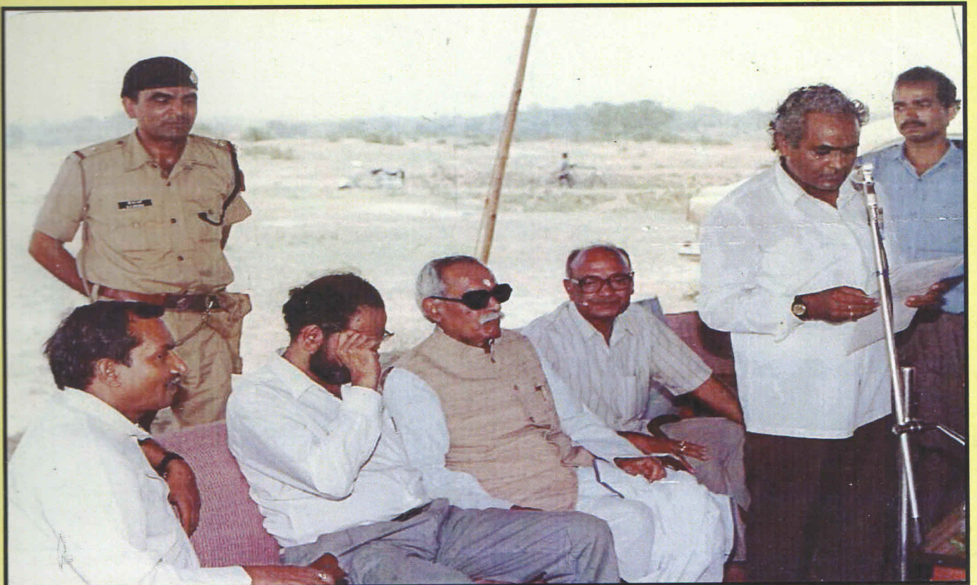
Foundation Laying ceremony on 05.06.1992